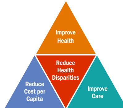
The Triple Aim+

Health reform offers new opportunities for primary care practices to transform their staffing and delivery models to provide higher quality and more efficient services. CHWs, as part of integrated care teams, contribute to cost-effective services that advance the Triple Aim for which providers are accountable: improved health, improved care, and reduced costs. CHWs also help reduce health disparities, a goal of health reform that is closely linked to achieving the more commonly highlighted dimensions of the Triple Aim.