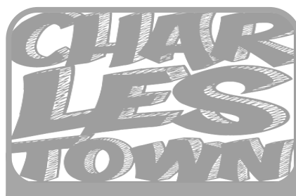
JAN 28: Stop the Stigma: Mental Health & Addiction

AUG 25: Immigrant Rights & the Presidential Election